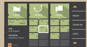
Touch Display (dust- & stain-resistant)